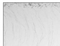
COVERAGE TOO LIGHT