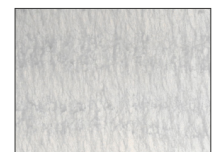
CORRECT APPLICATION = 20 dry gms/sqm