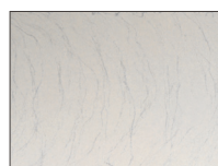
COVERAGE TOO LIGHT